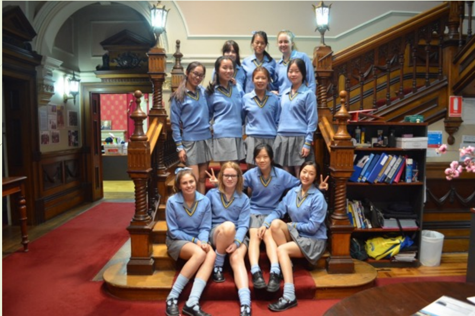
First day of school for our Year 12 Boarders 2015